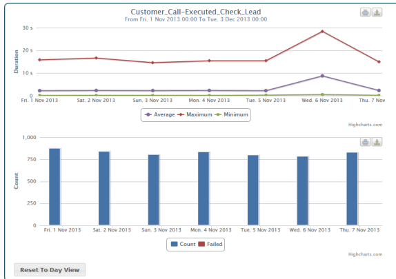
Figure: The Chart View

You can either switch to the Chart View directly by clicking the Chart tab. In this case, you can browse through the collected items using the Tree View and select an item to see the corresponding charts. Or, you can inspect the collected data using the Table View and branch to the Chart View by selecting an item that you want to inspect from a table.